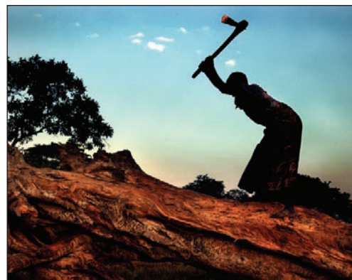
Despite the feminisation of poverty, most of the MDGs are 'gender blind'

It is clear that performance on the MDGs is mixed – with some countries doing very well, others less so, and a few doing badly. In general, sub-Saharan Africa is lagging behind on all the goals, and South Asia on those relating to human development. However, seeing the lack of progress as a particularly 'African' problem is misleading. Most of the poor live in South Asia (CPRC, 2008) and many are in large middle-income countries. Then there are specific MDG targets that are proving hard to reach in many developing countries.